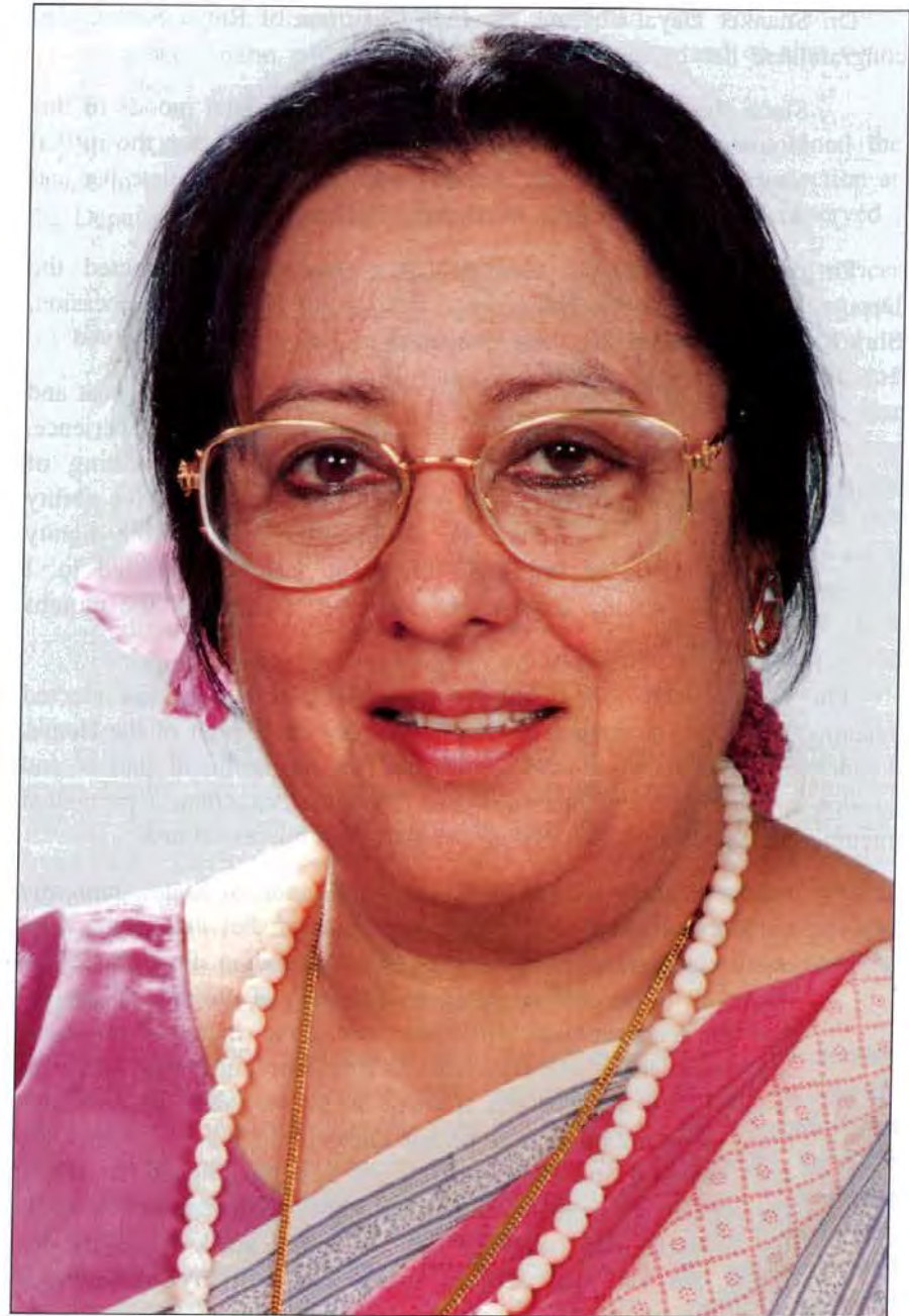
DR. (SMT.) NAJMA HEPTULLA (25.1.1985-20.1.1986) (18.11.1988-4.7.1992) (10.7.1992-4.7.1998) (9.7.1998-till date)