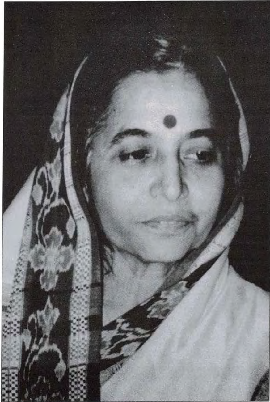
SHRIMATI PRATIBHA DEVISINGH PATIL (18.11.1986-5.11.1988)