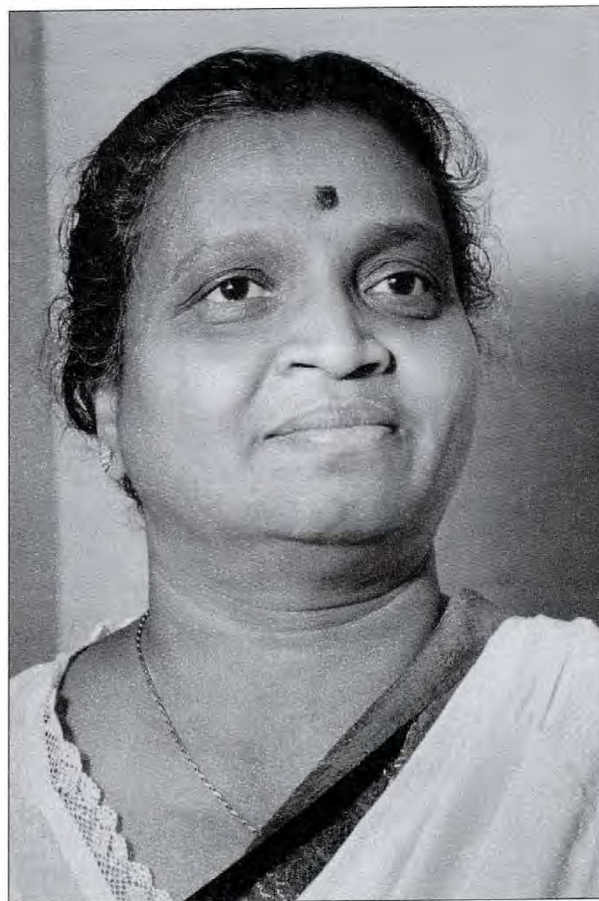
SHRIMATI VIOLET ALVA

Najmaji hails from a noble family, an old family. Though she comes of a veteran family yet her attire is modern. As if she combines the two different eras. She has done her M.Sc. in Zoology and secured her Doctorate in Cardio-Thoracic. She is a scientist. A learned lady like her rarely joins politics.