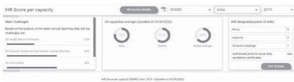
Figure 1 India IHR core capacities scores

India-IHR scores based on State party annual reporting tool 2019(self assessment) as reported by WHO